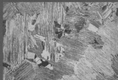
Prized: Continuous processes to make titanium more affordable – p26