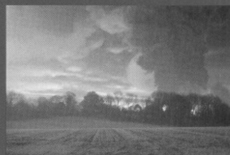
Buncefield: Investigators still can't explain the severity of the explosion – p28